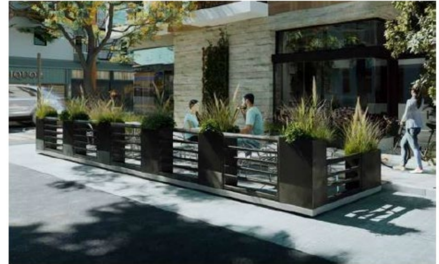
OUTDOOR DINING DECK DESIGN GUIDELINES