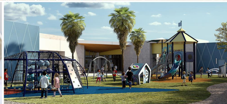
EISENHOWER CHILD CARE CENTER Rendering of the inside and playground