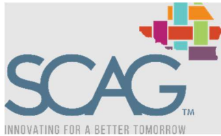
Exhibit B – Scope of Work Approval Form Regional Early Action Planning Grants of 2021 (REAP 2.0) [Full name of program] Scope of Work Approval Form - Project Summary