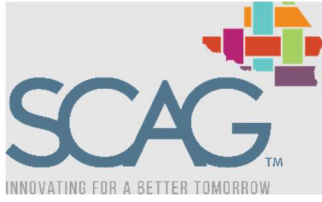
Exhibit B – Scope of Work Approval Form Regional Early Action Planning Grants of 2021 (REAP 2.0) [Full name of program] Scope of Work Approval Form - Project Summary

Signatures below to approve revisions also indicate approval of any modifications to subsequent pages.