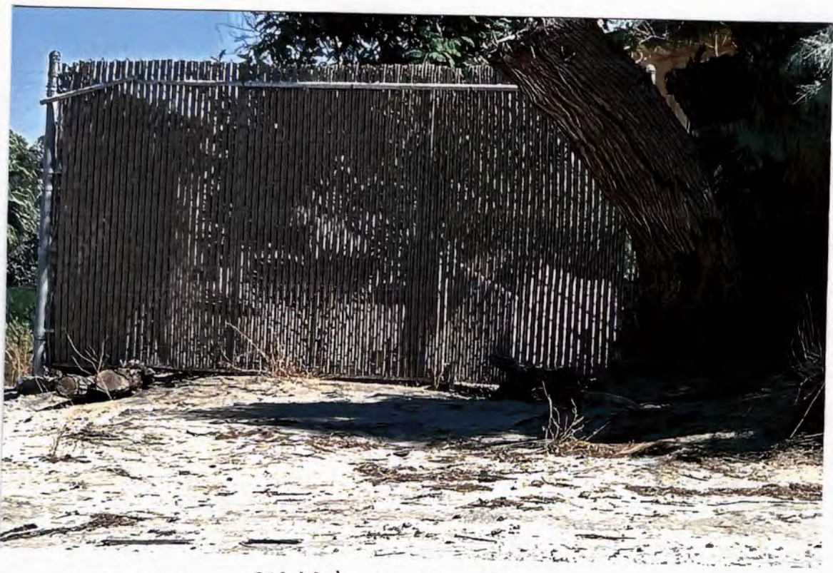
77776 CHAIN LINK PROPERTY MOUNTAIN VIEW