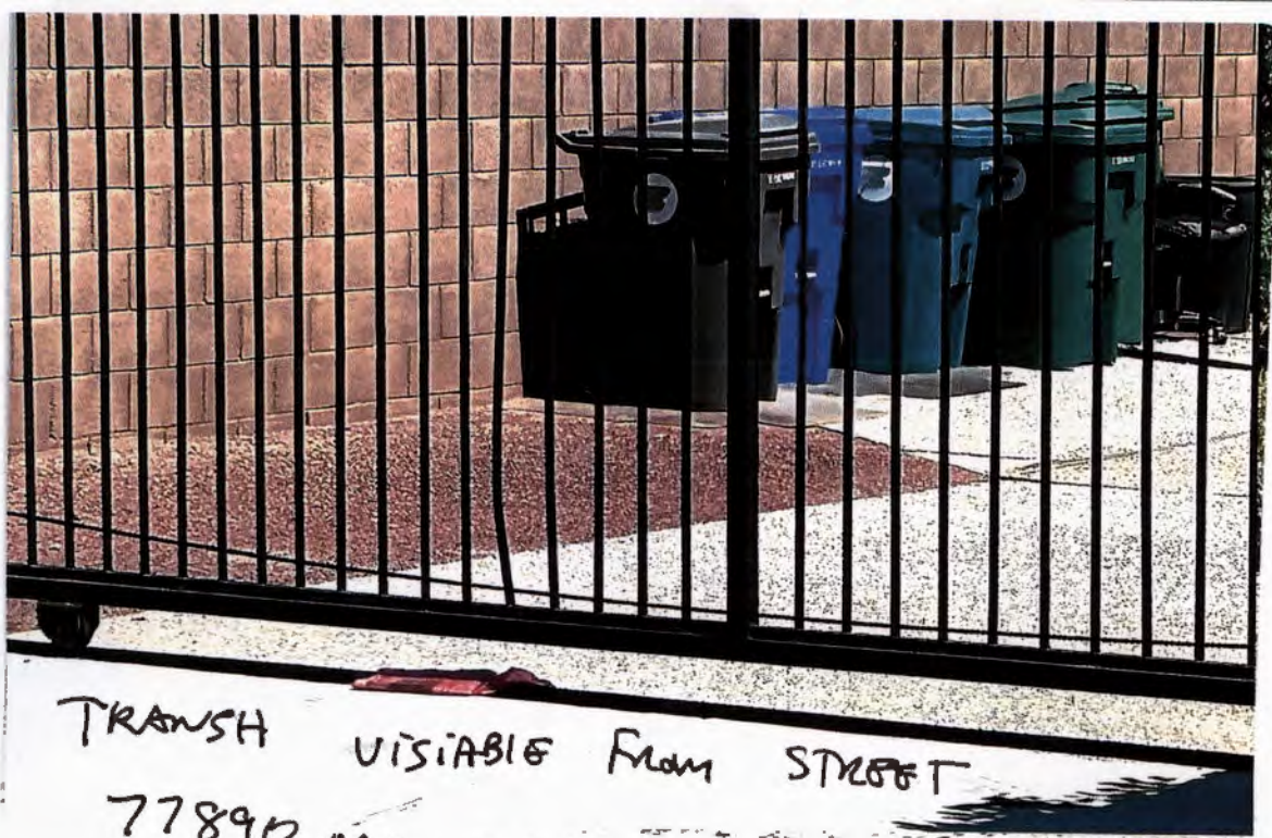
TRANSIT VISIBLE FROM STREET 77890 MOUNTAIN VIEW