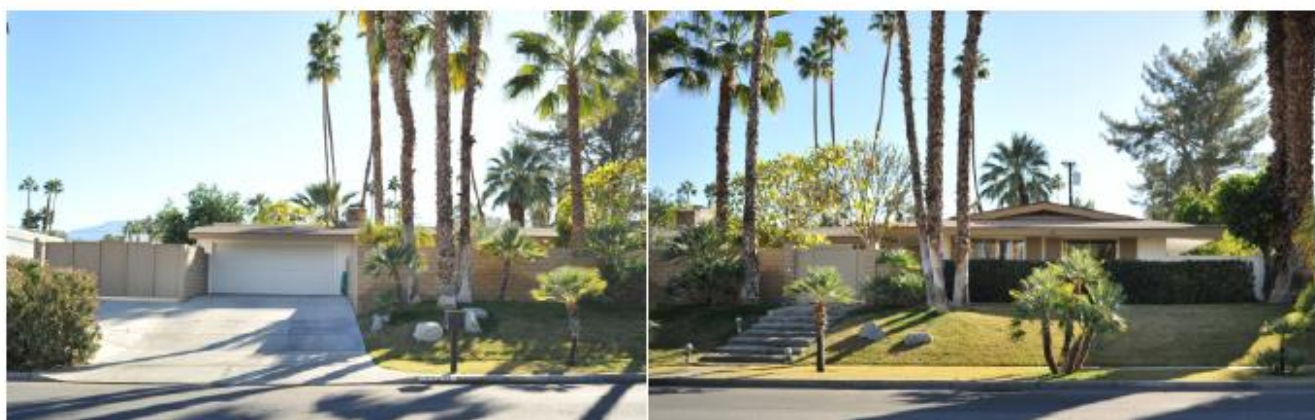
Exhibit 3 – View of Home from Willow Street

The Project has a great sense of entry, highlighted by the entry courtyard and original stone steps at the entry. The Home includes “lush landscaping”, per the Application, which includes twenty-one (21) palm trees, fourteen (14) fruit trees, several of which are original palms and fruit trees, and a variety of grass and shrubs in both the front and rear yard. Exhibit 4 provides an aerial view highlighting the trees and overall landscaping.