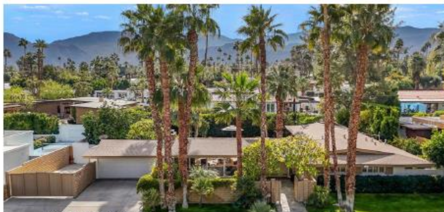
Figure 3 - NORTH ELEVATION (aerial view)