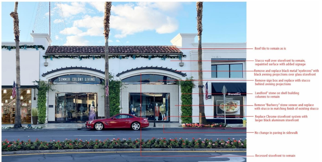
Figure 2 – Existing Building Façade