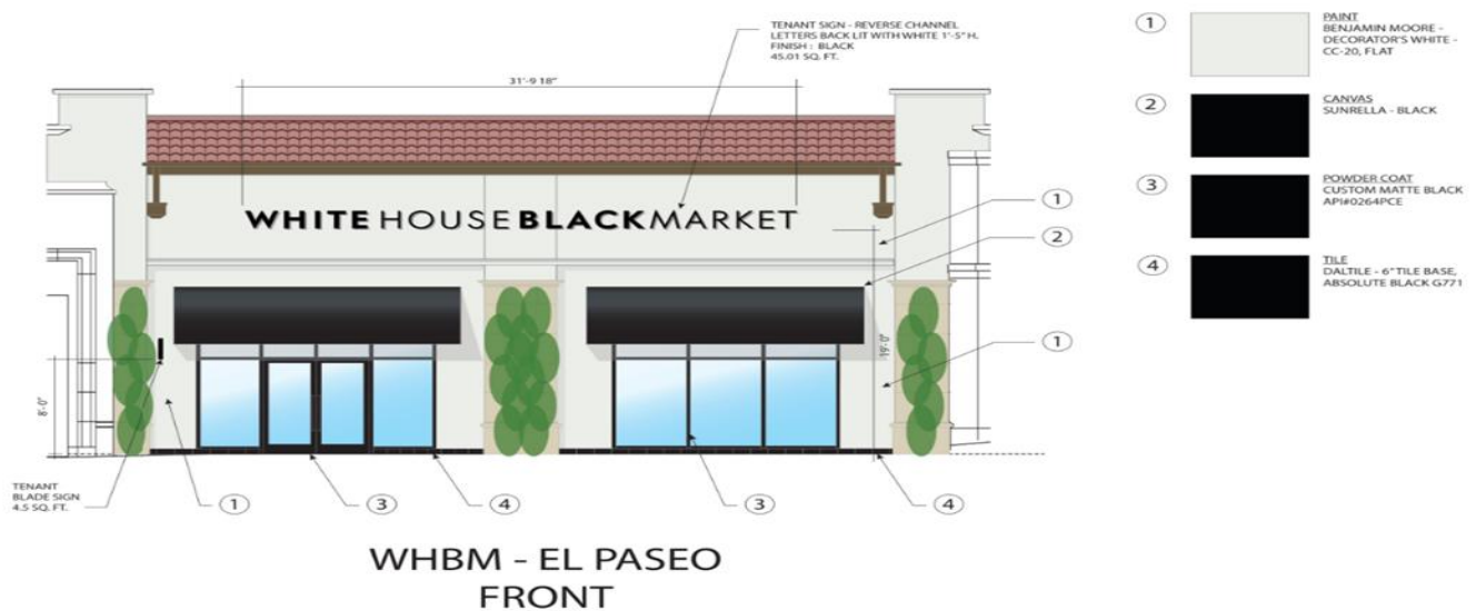
Figure 3 – Façade Modification Renderings