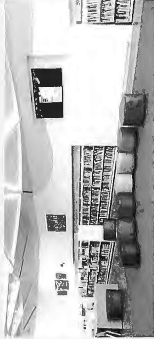
In an interior, large, whimsical space, the Storytime Area invites reading and learning together in cheery comfort.

For ongoing updates on the Literacy Legacy Program and answers to frequently asked questions, please visit our website: riversidelibraryfoundation.org