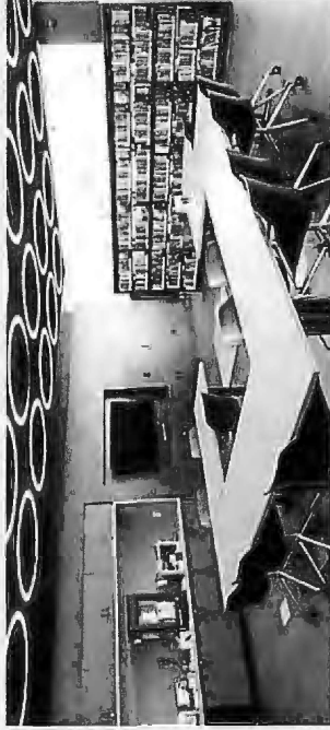
The Oculus Rift Virtual Reality Station, 3-D printers, a sound recording booth, iMac desktops, and the Young Adult book collection in the Innovation Center inspire aspiration and creativity.