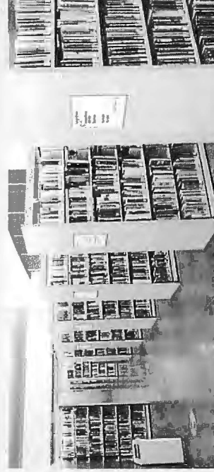
With views to the north and south, the fourth-floor Adult Collections space offers non-fiction, fiction, large-print, and Spanish books and materials.