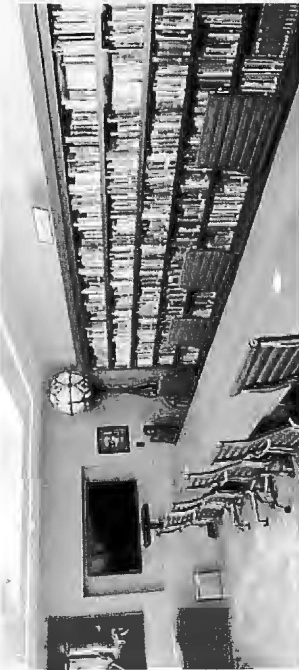
Illuminated globe and a vintage table from Riversid e's original Carnegie Library (1902) add elegance to this 12-seat reading/meeting space.