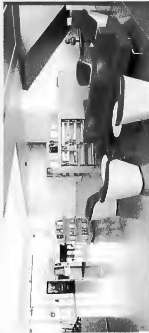
The Marketplace is the distinctive entry to the library featuring new books, self-check-out machines, laptop kiosks, and a grand piano.