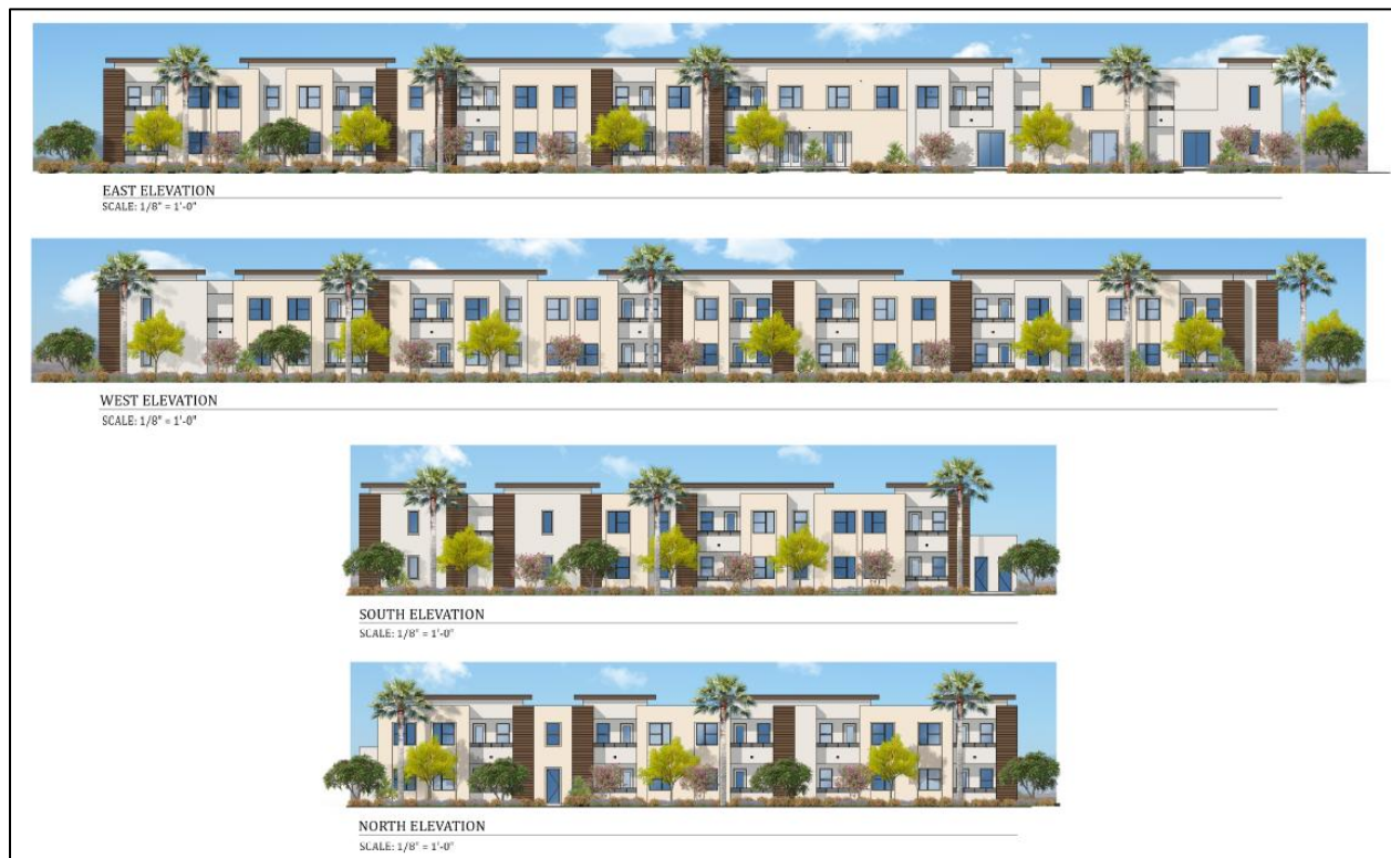
Figure 2: A rendering of the Arc Village development

adults with intellectual and developmental disabilities living throughout Riverside County and the Morongo Basin of San Bernardino County. Approximately 700 people, ages 18 and older, with diagnoses such as Autism, Cerebral Palsy, Down Syndrome, and Epilepsy are enrolled in Desert Arc's programs which encompass Adult Day Centers, Behavioral Programs, For Your Independence & Independent Living Skills supportive living services, Pathways to Employment, Cafeteria Services and Transportation to and from the campuses. The Arc Village development is intended to provide affordable housing to special needs households in close proximity to the Desert Arc campus. The City of Palm Desert Housing Authority partnered with the developers of the project by donating the vacant property on which the site will be developed and providing a loan in the amount of $3,000,000 for the project. The project developer, Chelsea Investments Corporation, successfully received funding from the California Tax Credit Allocation Committee ("TCAC") for an allocation of 9% Federal Tax Credits. The developer will work with the City secure required permitting by Spring 2025 and is expected break ground soon thereafter.