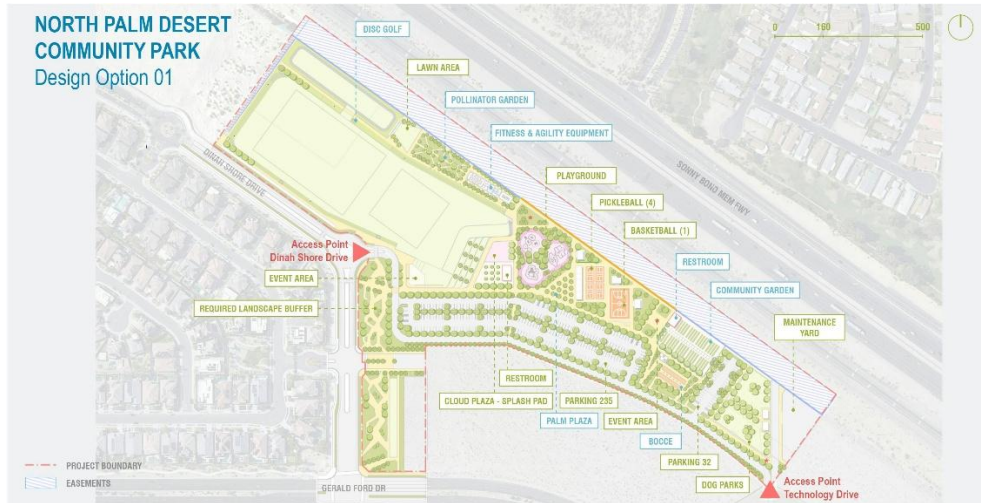
Figure 9: Design Renderings for the Community Park looking northeast from the intersection of Dinah Shore Drive and Gerald Ford Drive