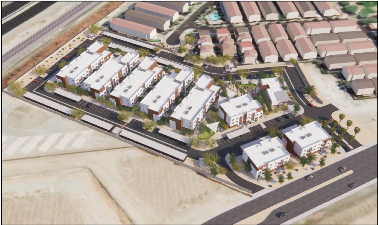
Figure 3: A rendering of the Agate Apartments approval

On June 7, 2022, the Palm Desert Planning Commission approved the Agate Apartment community (formerly known as the “Spanish Walk Apartments”). The community consists of 150 total multifamily units comprised of 149 deed-restricted units for qualifying low income households and one on-site manager’s unit. The development is under construction and expected to be completed in late 2024.