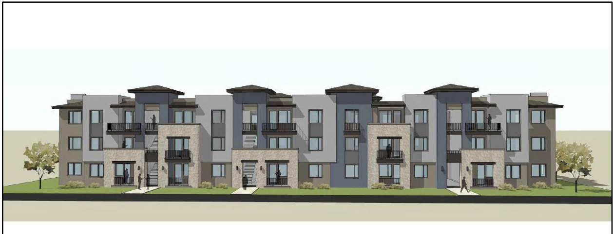
Figure 1: A rendering of the Vesta Apartments approval

On March 19, 2024, the Palm Desert Planning Commission approved Vesta Apartments. The project will develop a 384-unit market-rate apartment community comprised of fifteen (15) two- and three-story residential buildings on a 17.44-acre parcel at the southwest corner of Gateway Avenue and Dick Kelly Drive. The community will include 146,800 square feet (sf) of common open space, inclusive of pool and spa, fire pit, BBQ areas, dog park, playground, pickleball courts, and will also include a clubhouse and maintenance building area.