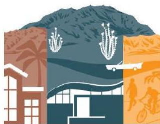
Figure 5: City of Palm Desert Unified Development Code Logo

A kick-off meeting and session with the City Council occurred in September 2024. Initial stakeholder interview meetings were held with the Architectural Review Commission, Planning Commission, and City staff. Additional meetings and community surveys were conducted in November 2024. The City will present an issue identification and zoning code analysis to the City Council in Spring 2025. Code drafting will continue through June 2026. With final hearings, and workshops planned in Late 2026.