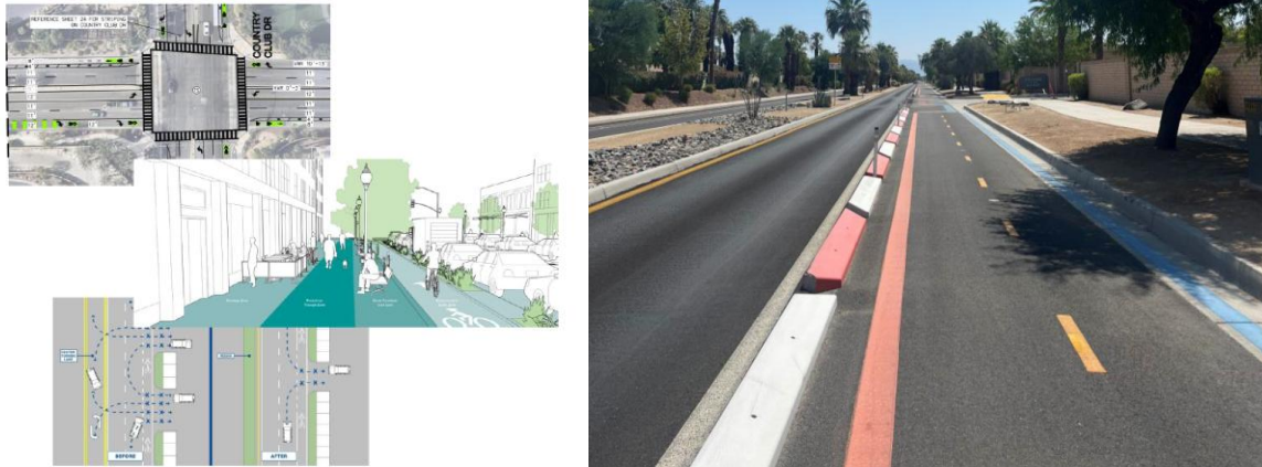
Figure 7: Roadway Design Considerations – Circulation Element Update