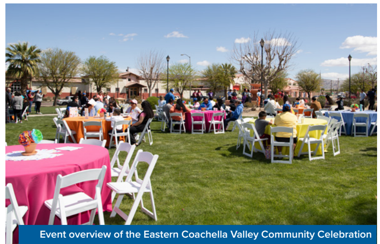
Event overview of the Eastern Coachella Valley Community Celebration