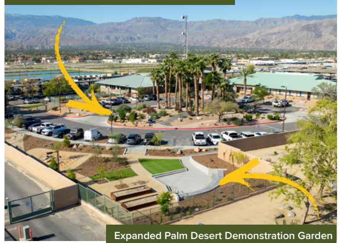
Expanded Palm Desert Demonstration Garden

The garden is irrigated with recycled water and uses a solar-powered smart irrigation controller. This device provides proper irrigation hydro-zones based on plants' water needs. Upcoming plans include adding plant identification labels to provide information such as species, common name, and family name of each plant.