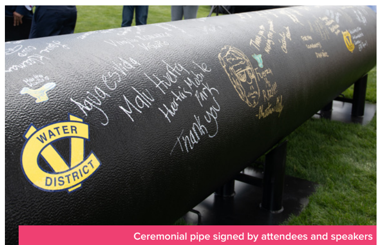
Ceremonial pipe signed by attendees and speakers