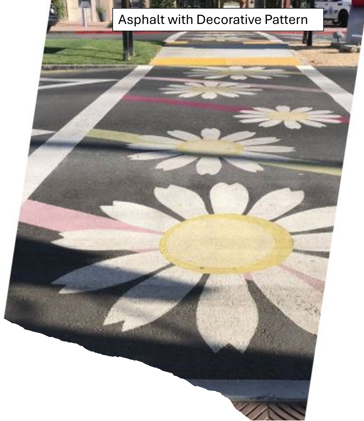
Asphalt with Decorative Pattern