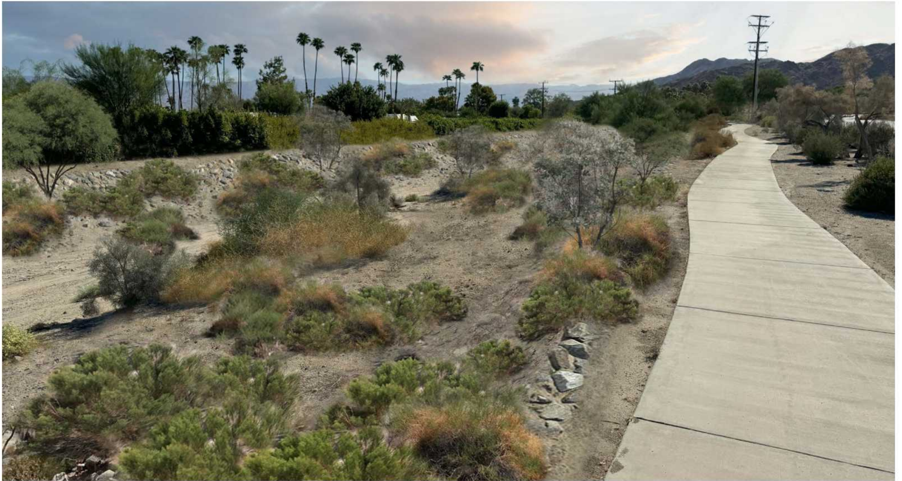
PHOTO 10 PROPOSED CHANNEL IMPROVEMENTS AT MATURITY