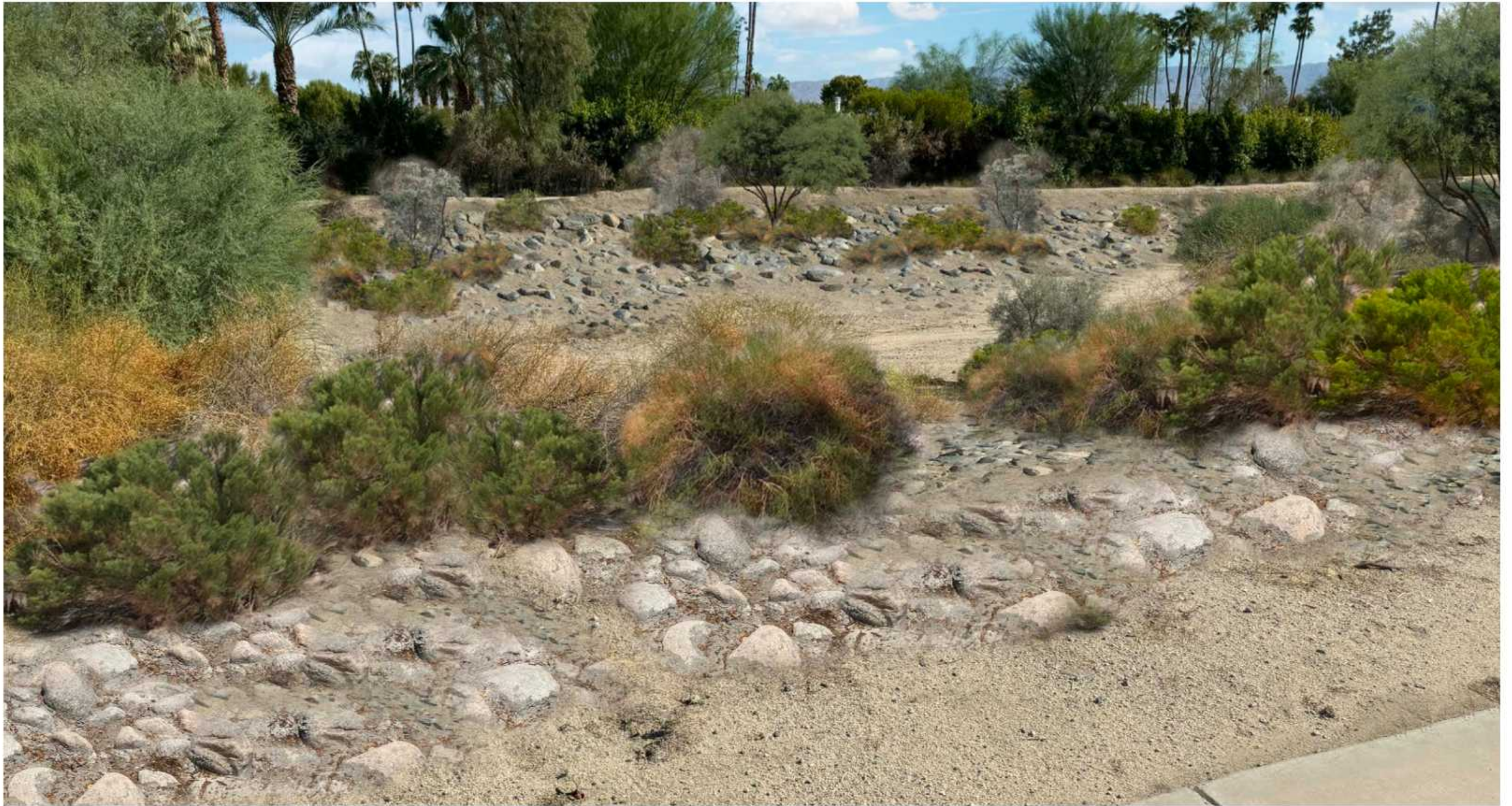
PHOTO 12 PROPOSED CHANNEL IMPROVEMENTS AT MATURITY