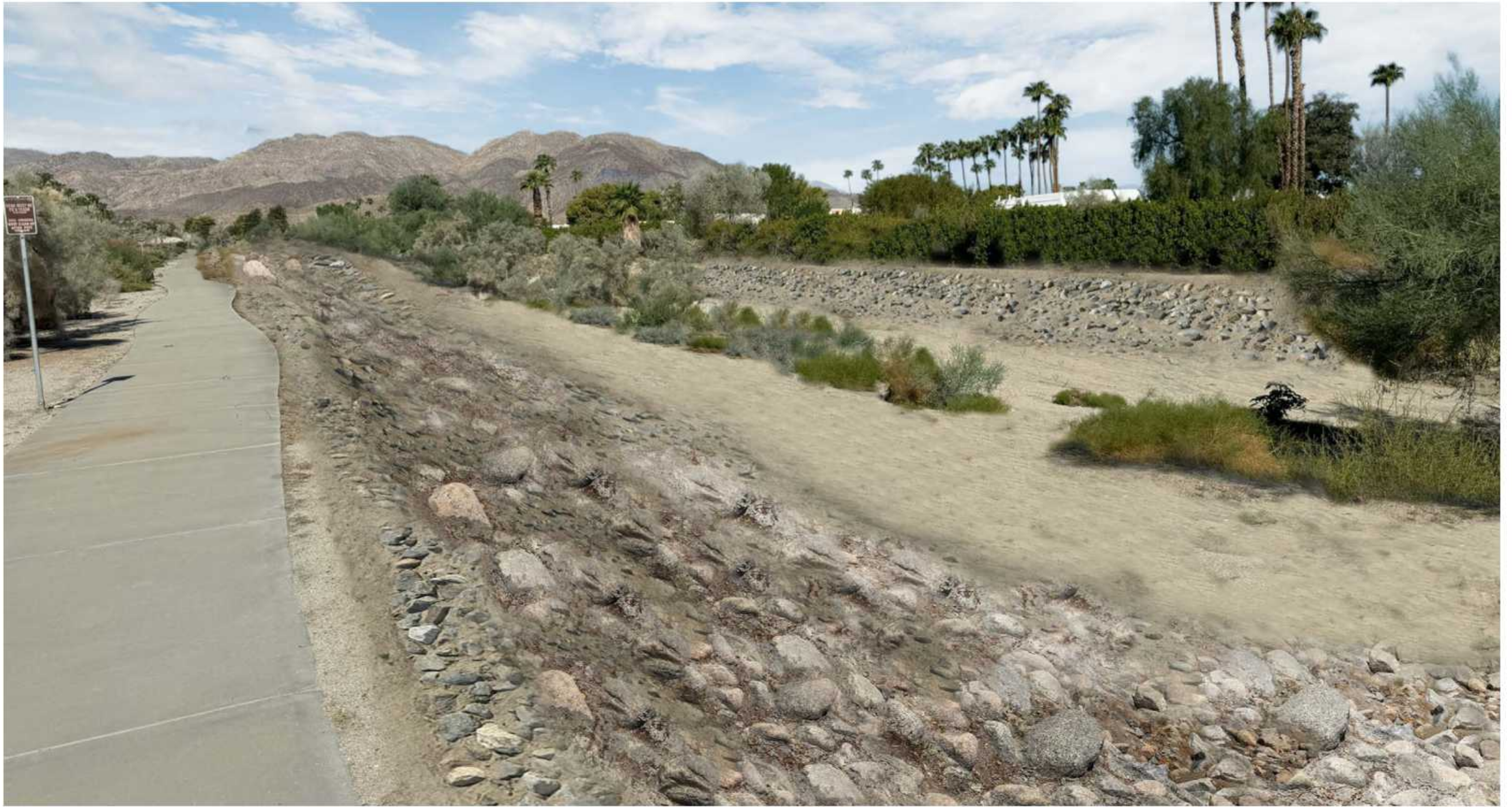
PHOTO 11 PROPOSED CHANNEL IMPROVEMENTS AT INSTALL