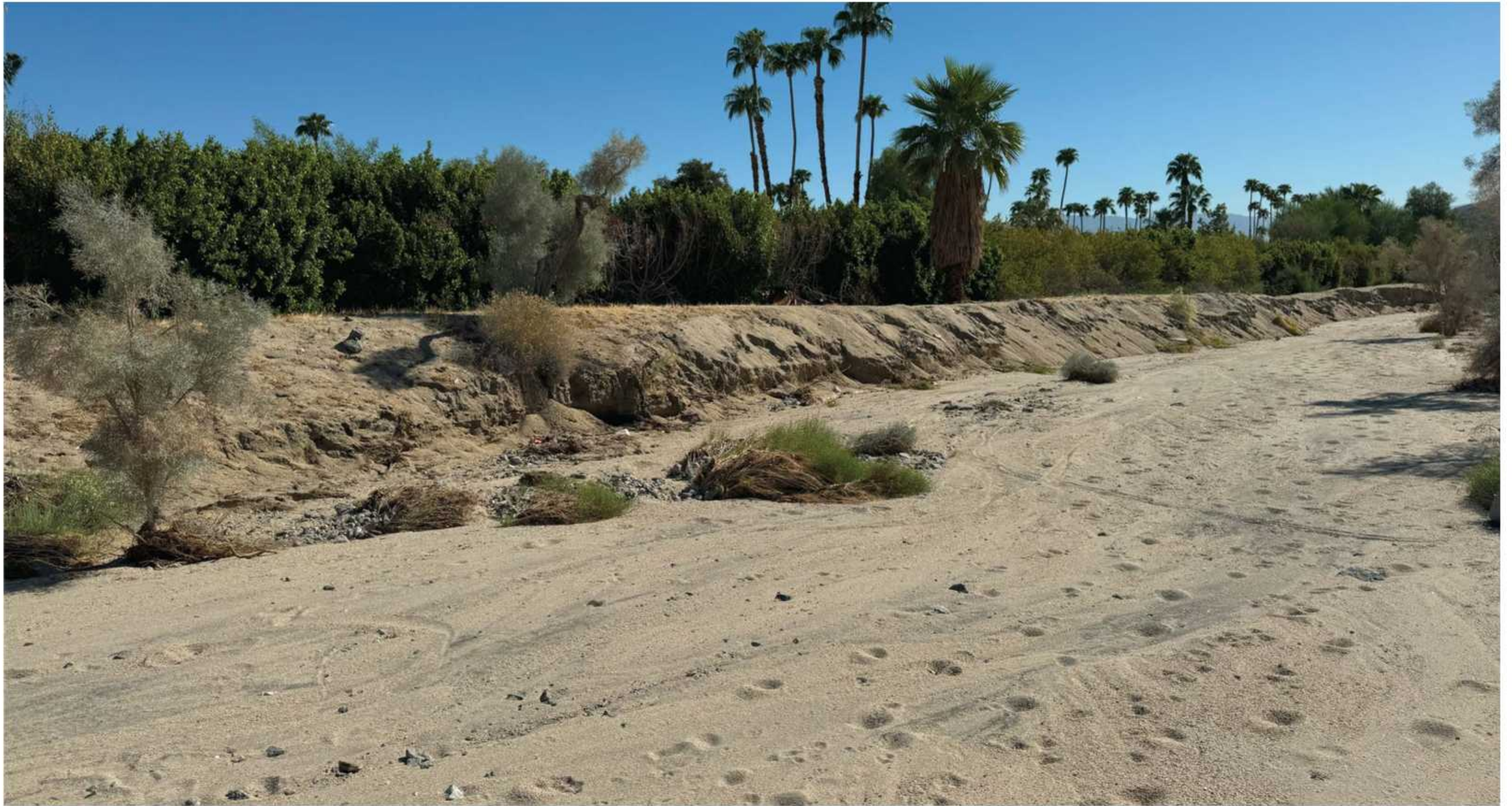
PHOTO 6 EXISTING CONDITIONS