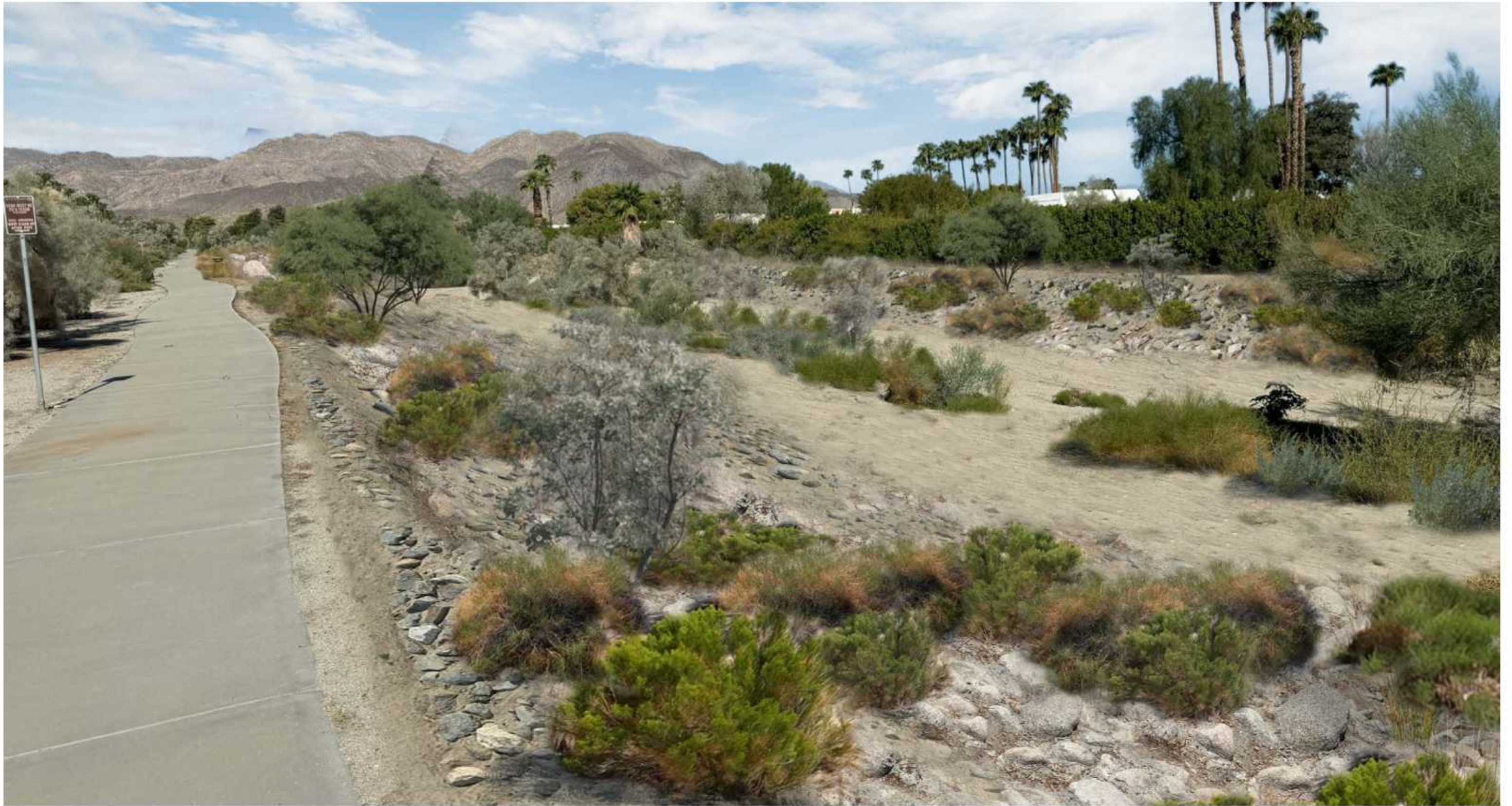
PHOTO 11 PROPOSED CHANNEL IMPROVEMENTS AT MATURITY