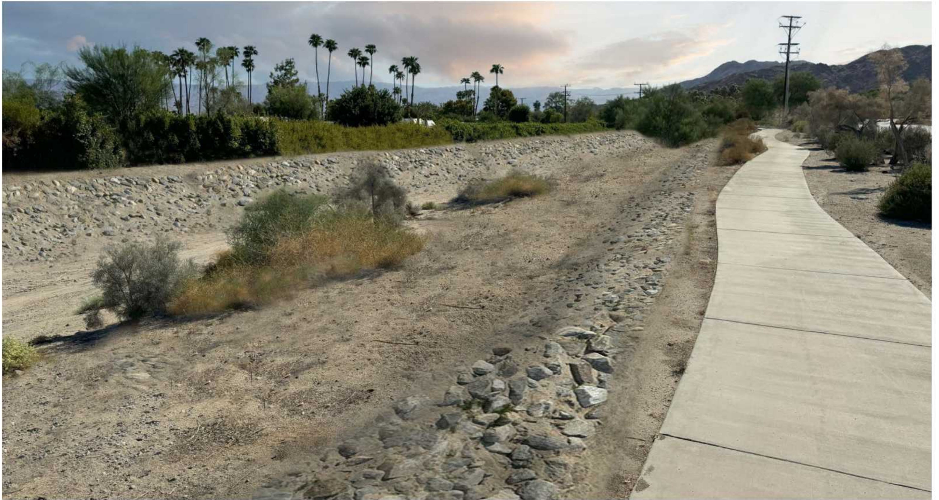
PHOTO 10 PROPOSED CHANNEL IMPROVEMENTS AT INSTALL