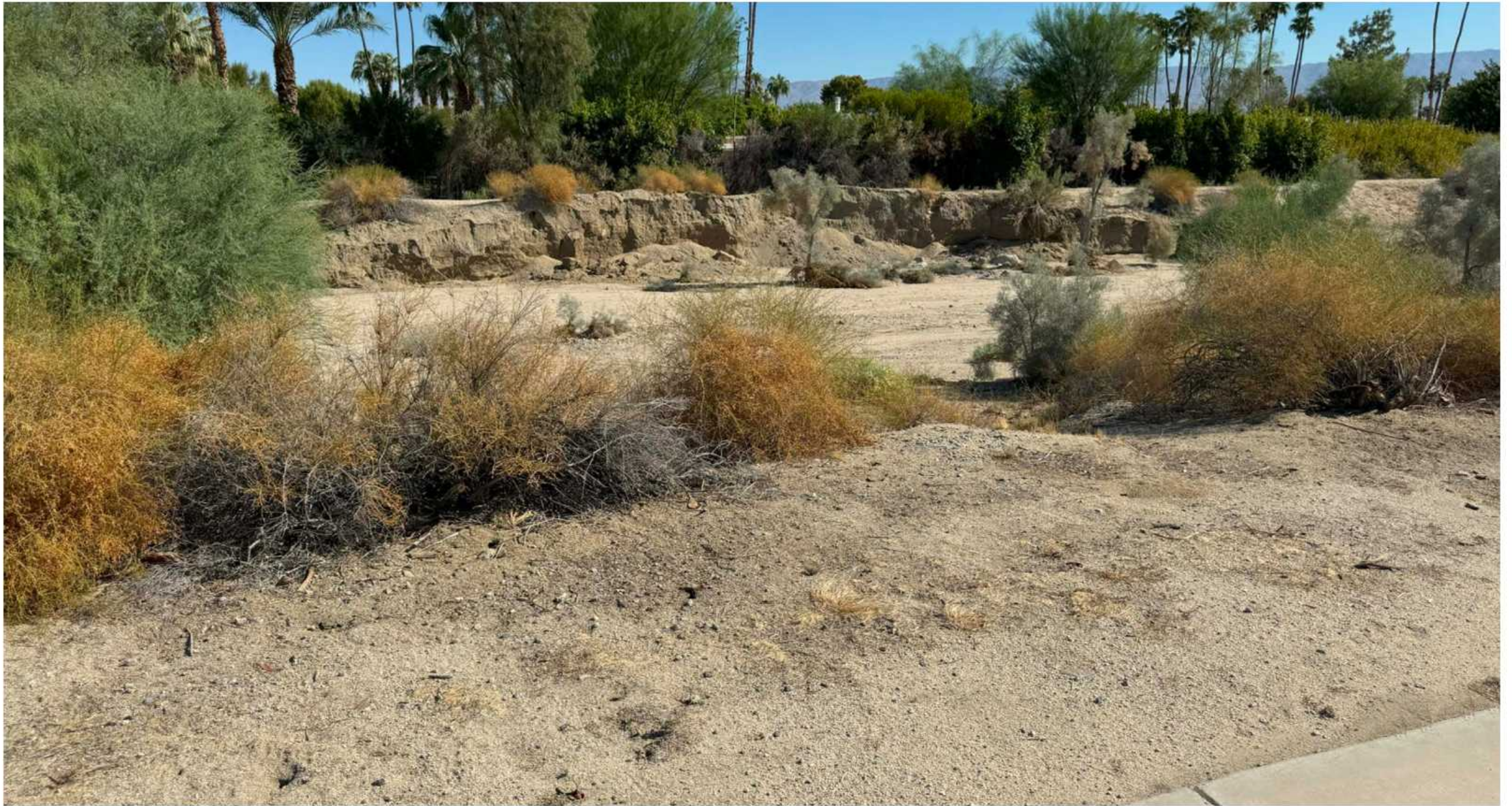
PHOTO 12 EXSITING CONDITIONS