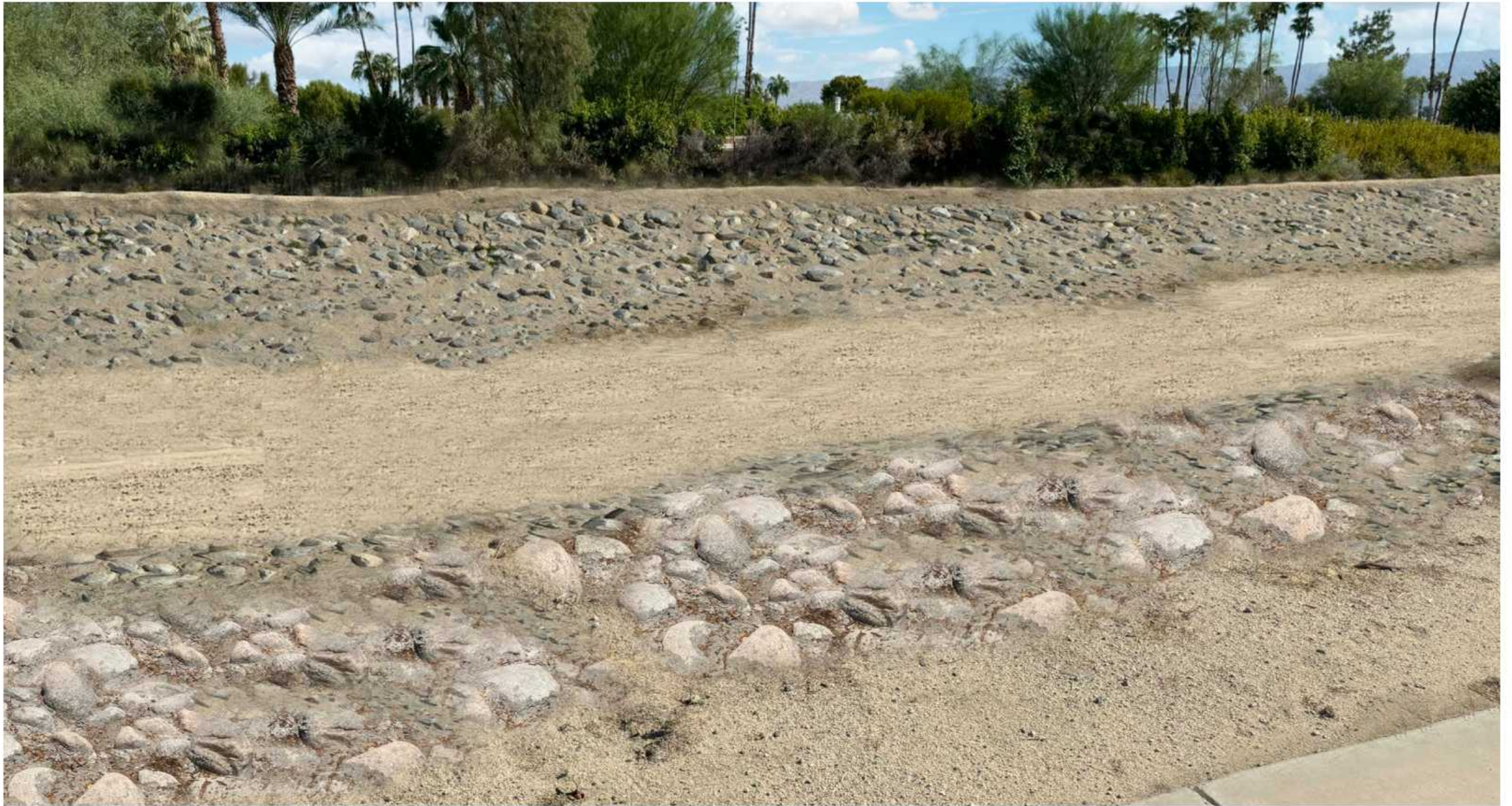
PHOTO 12 PROPOSED CHANNEL IMPROVEMENTS AT INSTALL