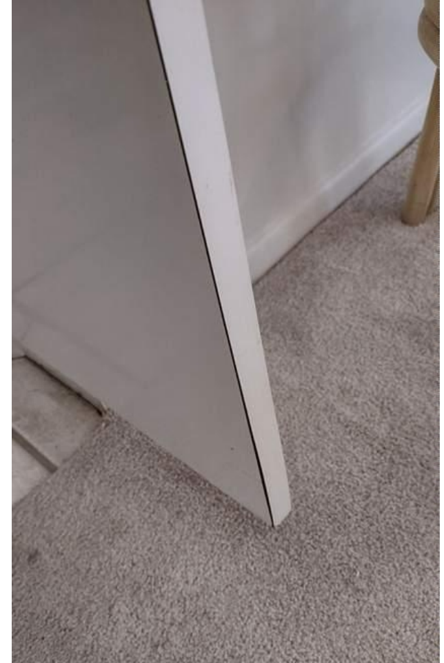
REPAIR/RESTORE ORIGINAL LAMINATE