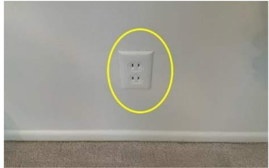
REPLACE RECEPTACLES WITH GROUNDED (TYPICAL THROUGHOUT)