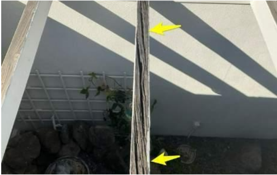
MOISTURE DAMAGE TO WOOD RAFTERS