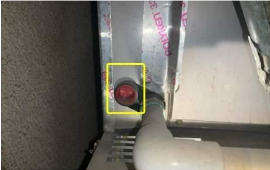
INSTALL MICROSWITCH TO SECONDARY CONDENSATE DRAIN LINE