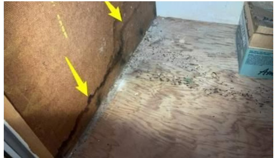
WATER INFILTRATION CONCERNS