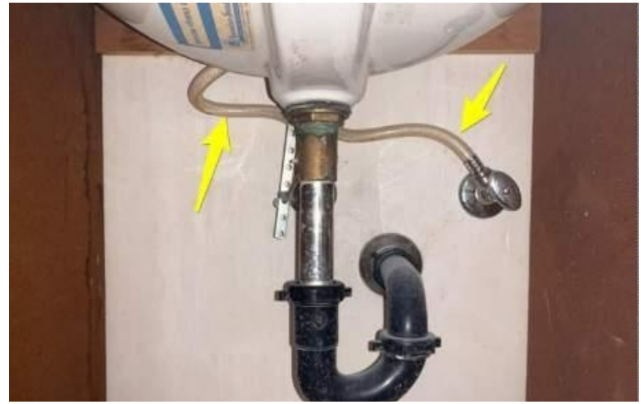
REPLACE PLASTIC SUPPLY LINES (TYPICAL THROUGHOUT)