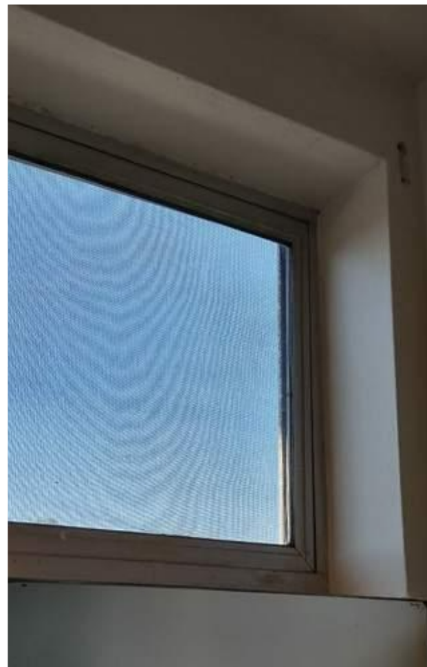
CLERESTORY WALL REPAIR EAST