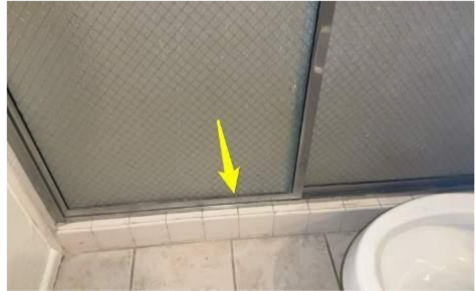
RESTORE & RESET ORIGINAL SHOWER DOORS & TRACK