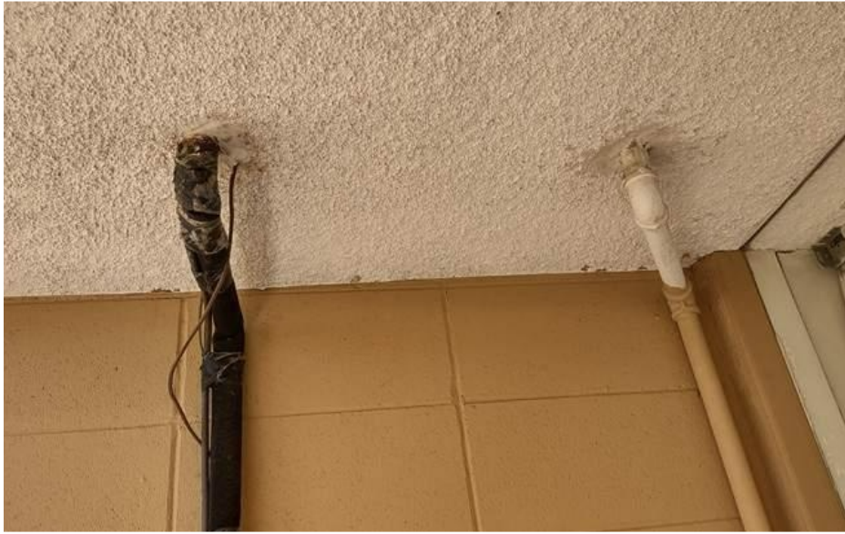
REMOVE REFRIGERANT LINES, REPAIR PLASTER