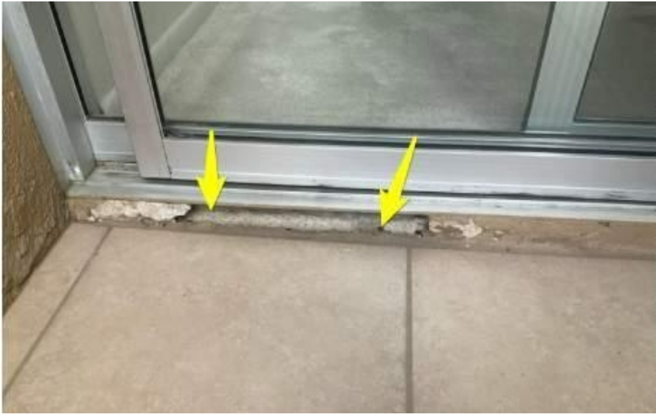
PLASTER DAMAGE UNDER WEST SLIDING DOOR