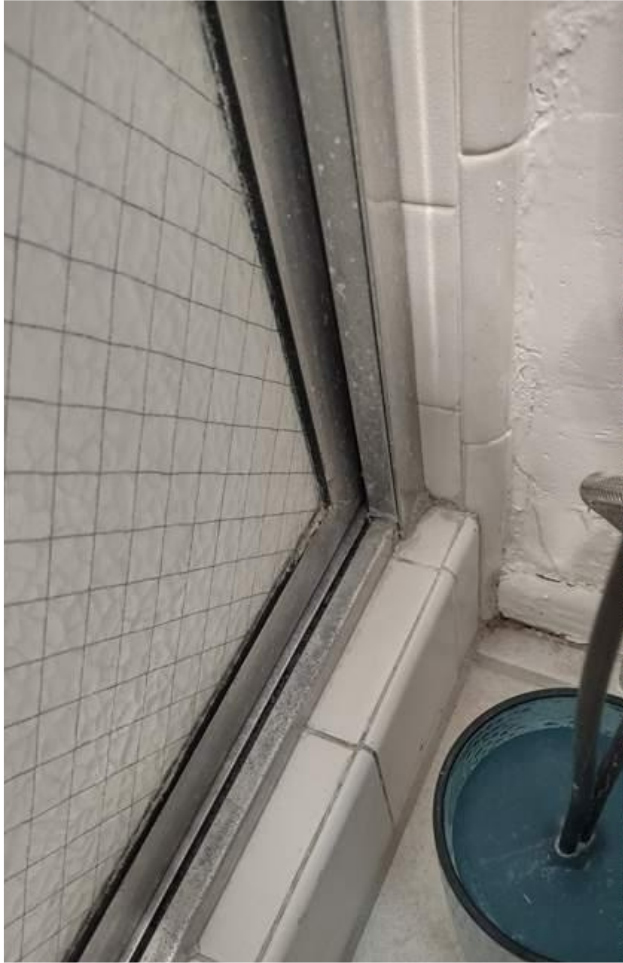
TILE & WALL REPAIR