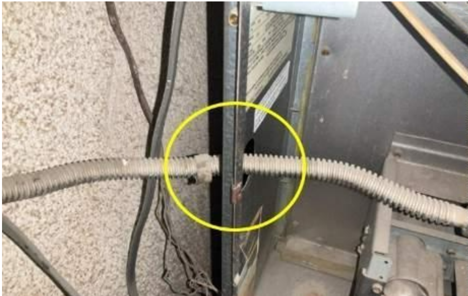
REPLACE NON-COMPLIANT FLEXIBLE GAS SUPPLY