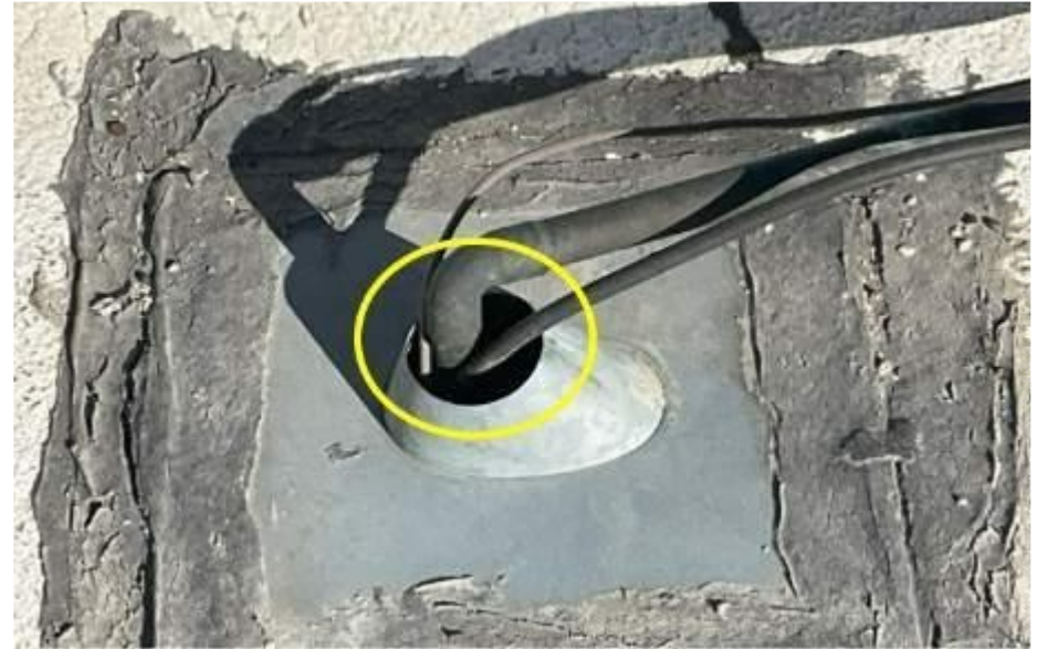
IMPROPERLY INSTALLED FLASHING