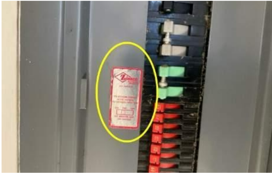
DANGEROUS MAIN ELECTRICAL PANEL SHOULD BE REPLACED