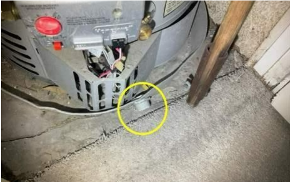
REPLACE WATER HEATER PAN AND INSTALL DRAIN LINE