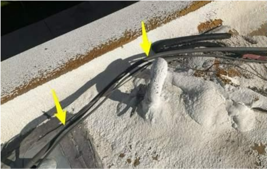
REPLACE DETERIORATED INSULATION ON REFRIGERANT LINES