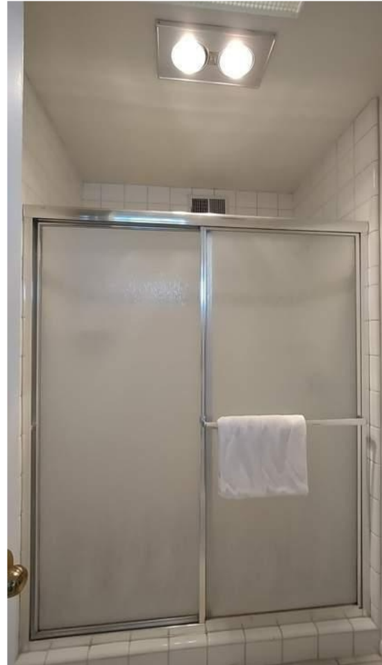
RESTORE SHOWER ENCL.