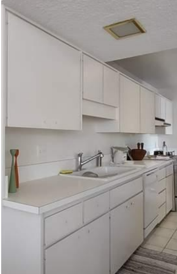
REPAIR/RESTORE ORIGINAL CABINETS