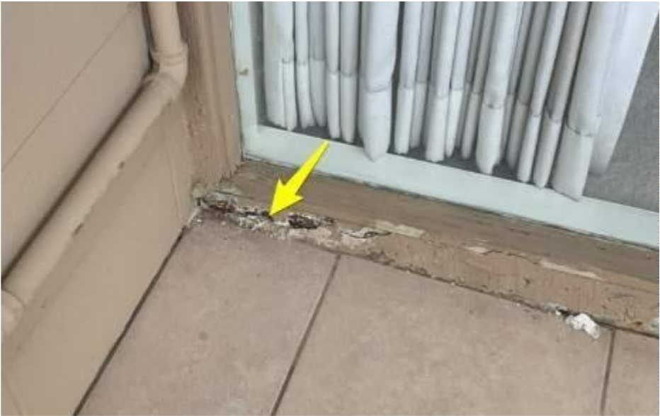
PLASTER DAMAGE AT EAST PATIO