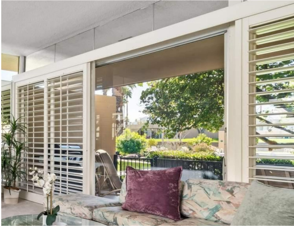
REMOVE WALL OF SLIDING WOOD SHUTTERS, REPAIR/REPAINT