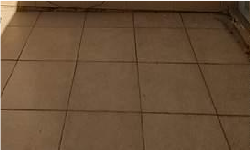
RESTORE MISSING ORIGINAL PLANTER IN NORTH PATIO