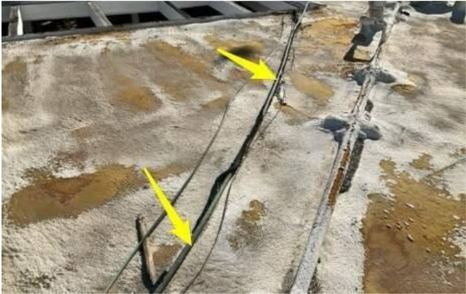
RE-ROUTE & RE-INSULATE EXISTING REFRIGERANT LINES