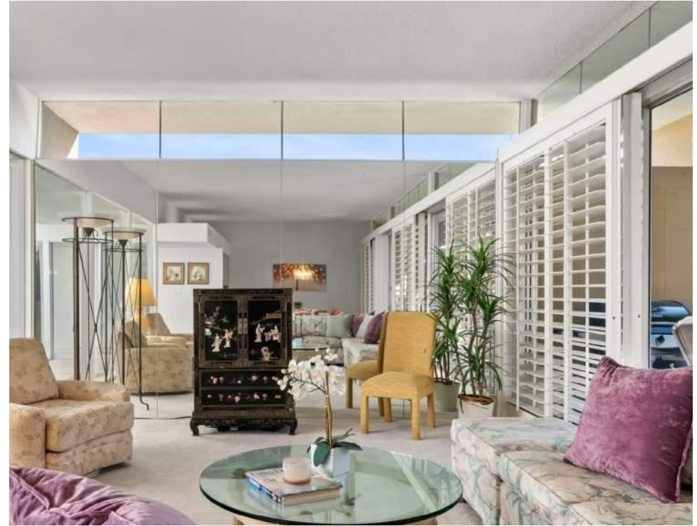
REMOVE MIRRORS, RESTORE EXPOSED BLOCK SIM. TO EXTERIOR WALL