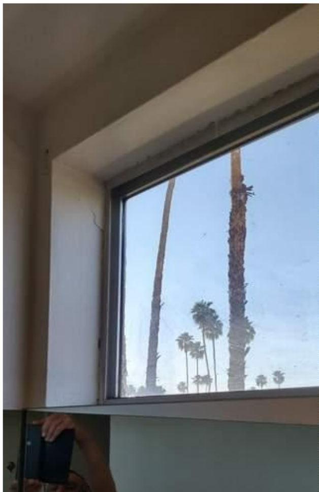
CLERESTORY WALL REPAIR WEST