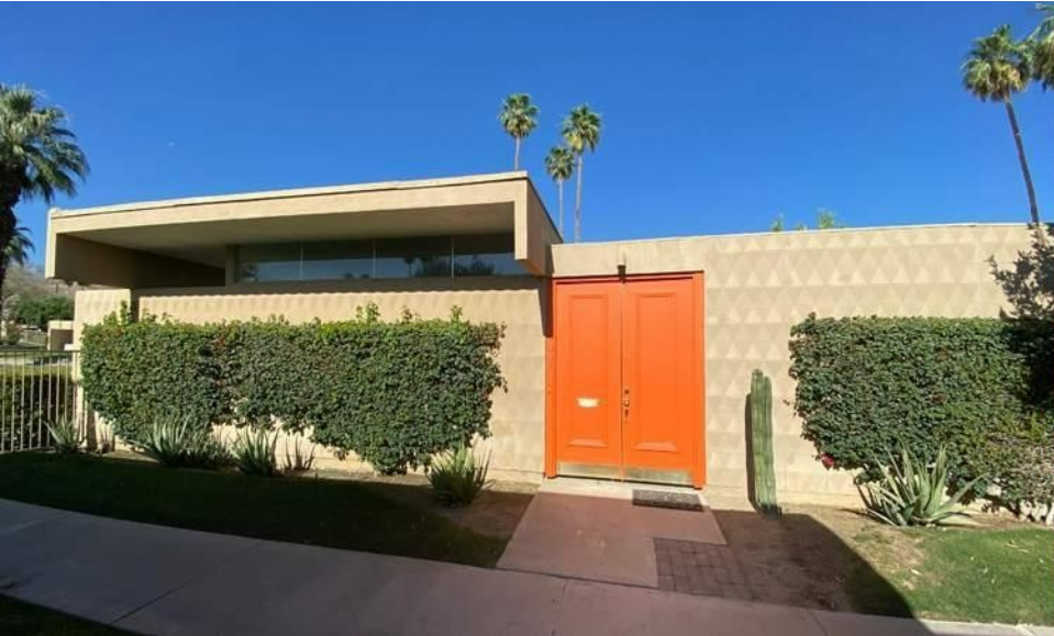
EAST ELEVATION - ENTRY