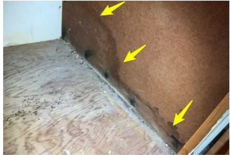
INVESTIGATE POTENTIAL WATER ISSUES, REPAIR DAMAGED MATERIALS