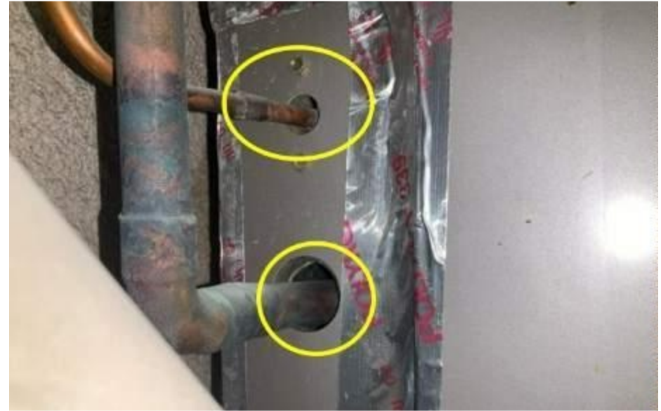
SEAL LEAKING COIL PLENUM