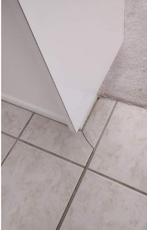
REMOVE NON-ORIGINAL KITCHEN FLOOR