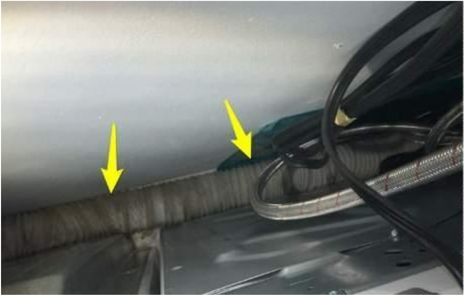
REPLACE NON-COMPLIANT VINYL DRYER VENT