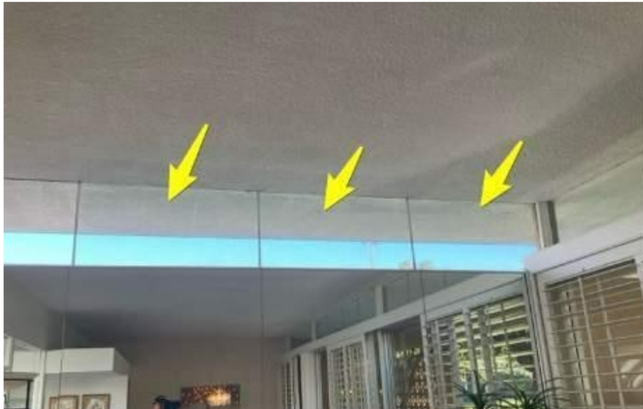
REPLACE DETERIORATED WINDOW FILM (TYPICAL THROUGHOUT)