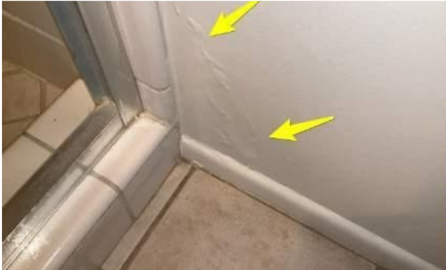
LEAK INVESTIGATION, REPAIR, WALL REPAIR