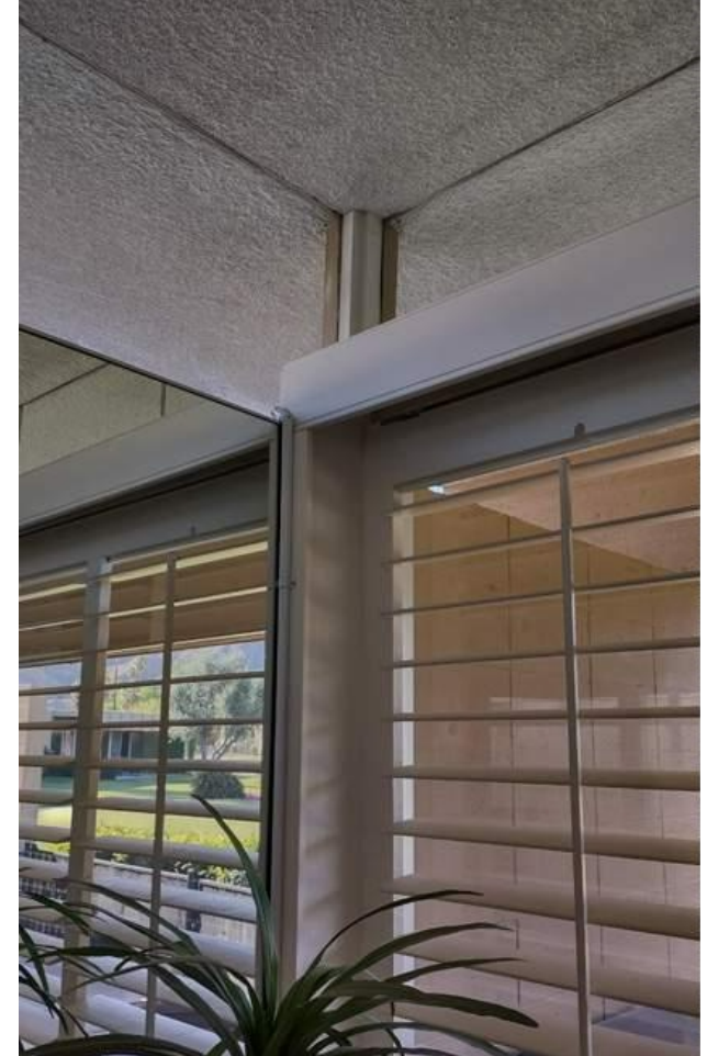
CEILING & PLASTER REPAIR