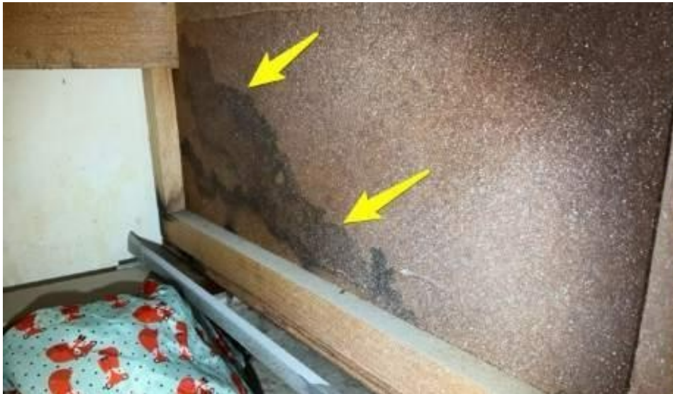
WATER INFILTRATION CONCERNS, REPAIR DAMAGED MATERIALS