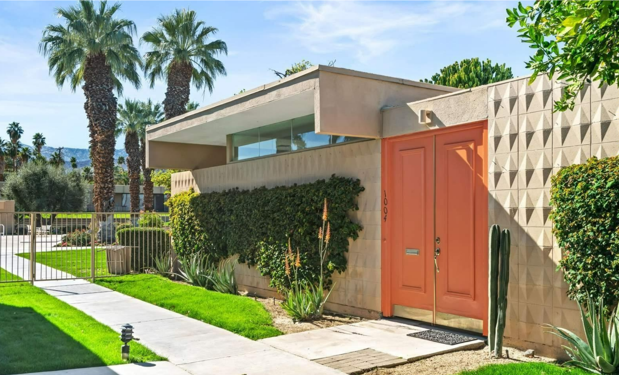
FRONT (ENTRANCE) ELEVATION - LOOKING SOUTHWEST