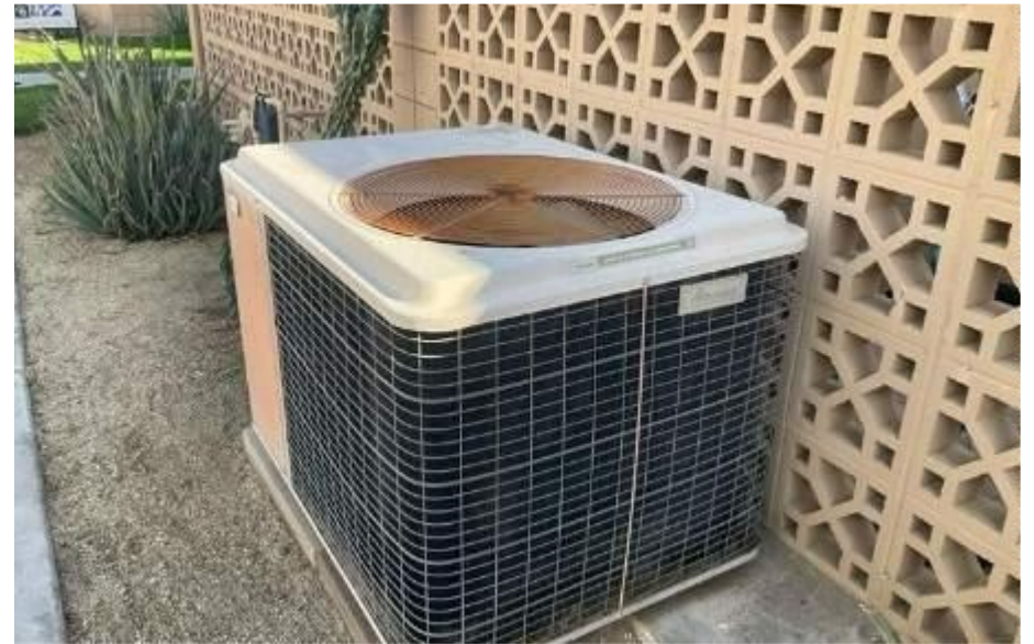
REPLACE 40 YEAR OLD HEATING/AC CONDENSER