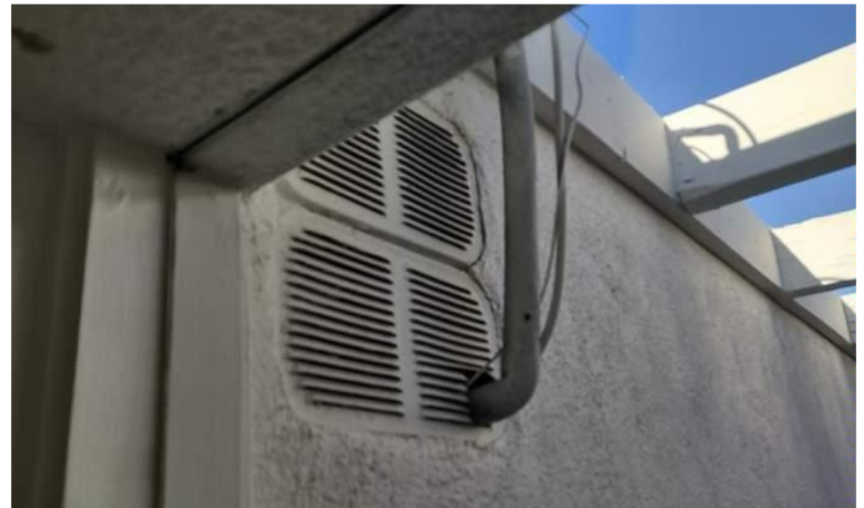
RE-ROUTE REFRIGERANT LINES, REMOVE FROM ATRIUM, RESTORE GRILL