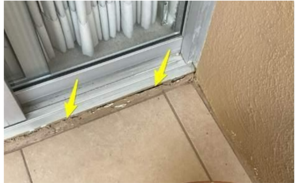
PLASTER DAMAGE UNDER EAST SLIDING DOOR