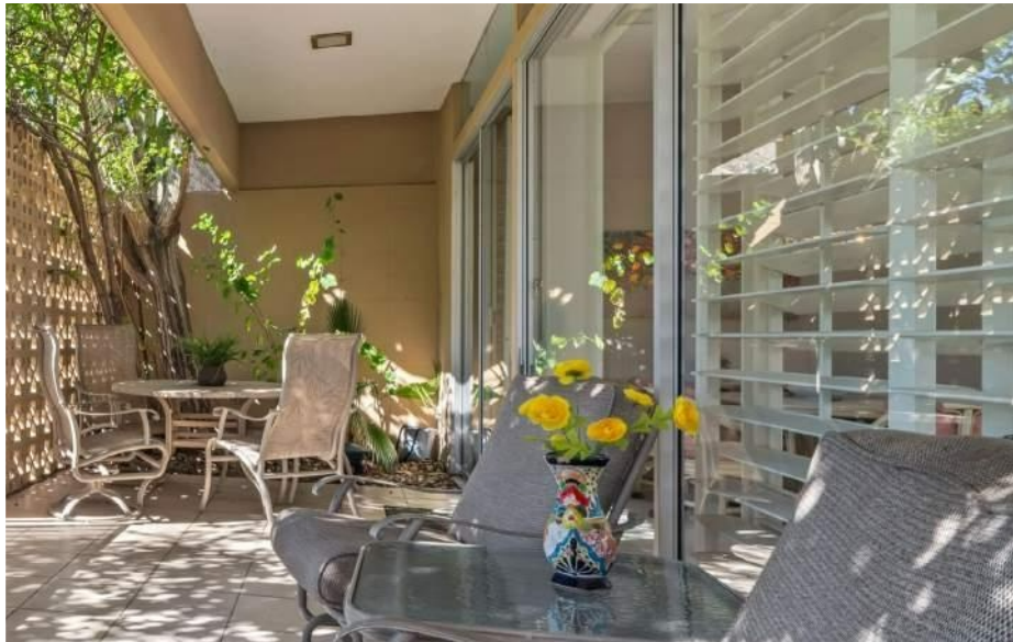
FABRICATE MISSING SCREENS FOR LIVING ROOM SLIDING DOORS