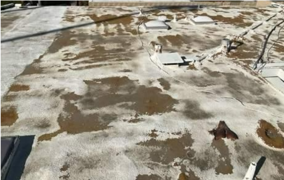
ROOF MASTIC DAMAGED OR MISSING