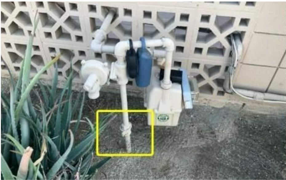
INSTALL EARTHQUAKE SHUT-OFF VALVE TO GAS LINE