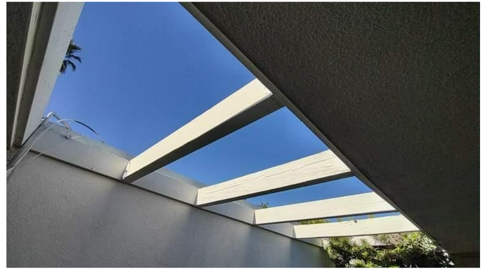
EXPOSED WOOD RAFTERS