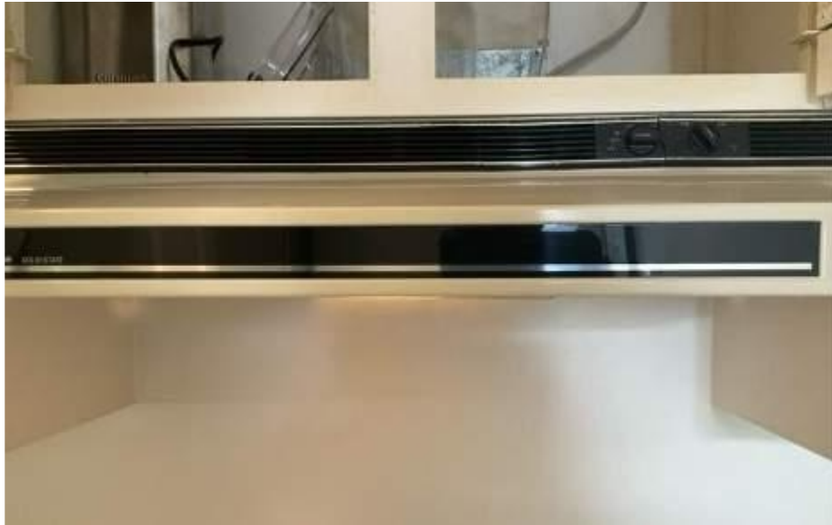
REPLACE NON-WORKING STOVE HOOD/EXHAUST FAN