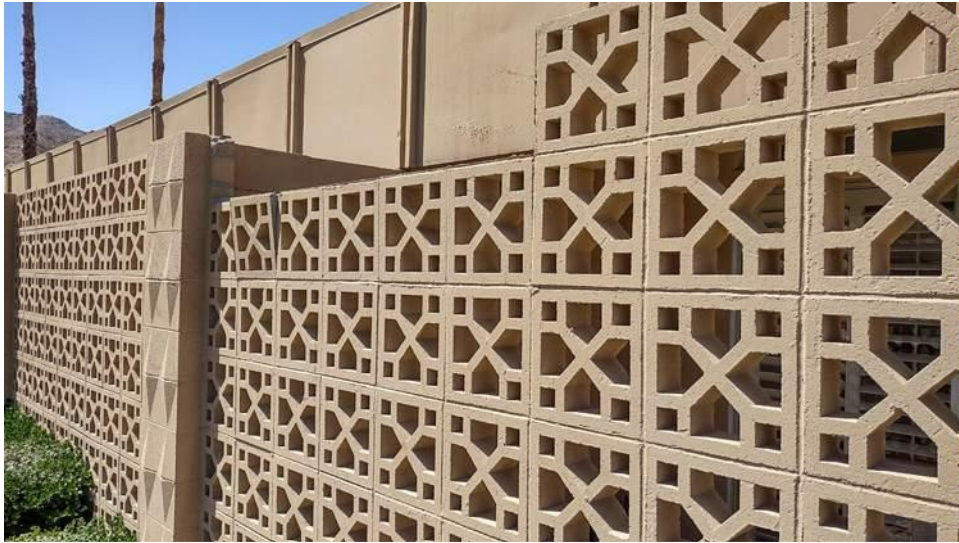
SOUTH ELEVATION VIEW OF MISSING BREEZE BLOCK