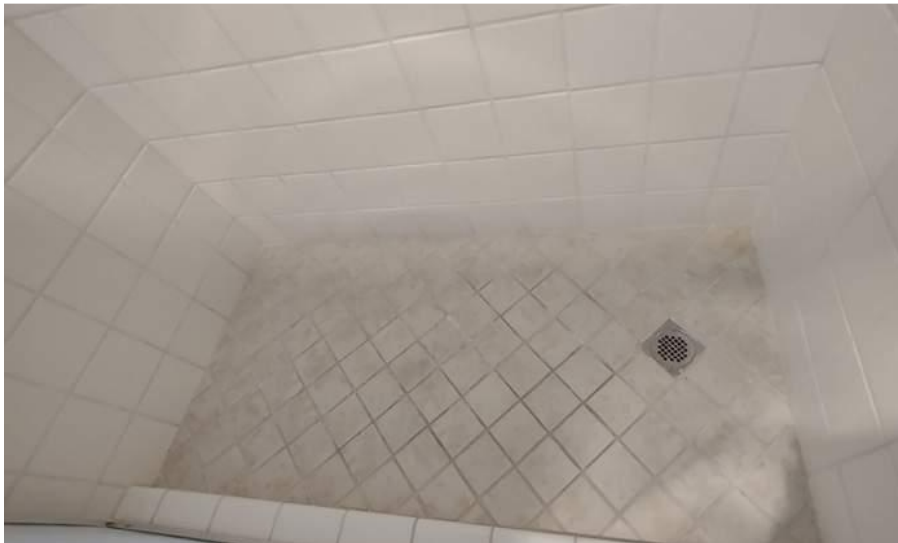
RESTORE SHOWER TILE