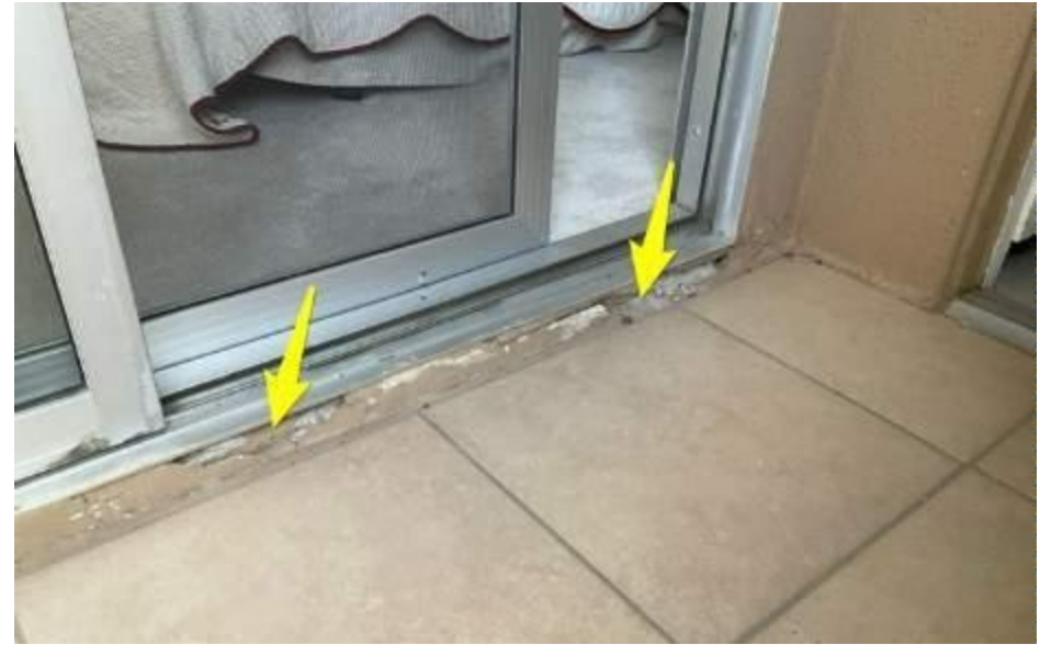
PLASTER DAMAGE UNDER WEST SLIDING DOOR