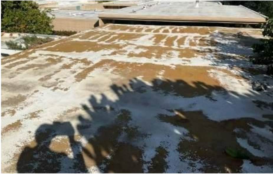
ORIGINAL ROOF REQUIRES COMPLETE REPLACEMENT