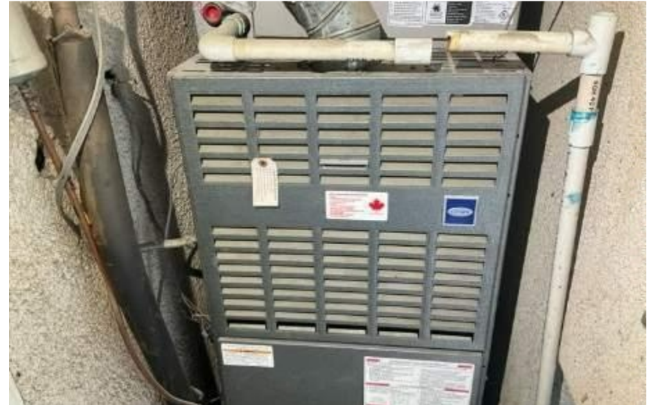
REPLACE/REPAIR CONDENSATE DRAIN LINE