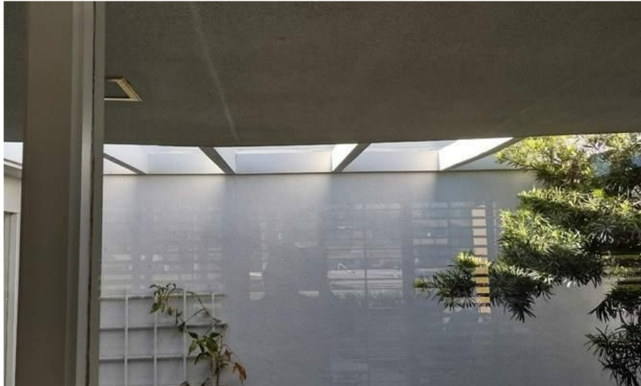
STRUCTURAL FRAMING CONCERNS