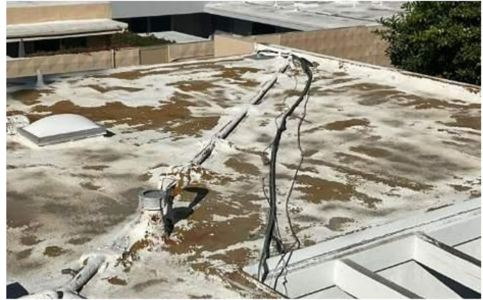
SEVERELY DAMAGED ORIGINAL ROOF COATING