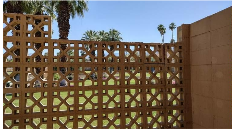
VIEW OF MISSING/DAMAGED BREEZE BLOCK FROM PATIO