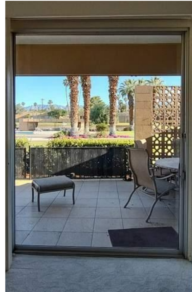
RESTORE ORIGINAL ALUMINUM SLIDERS (TYPICAL FOR ALL SLIDING DOORS)