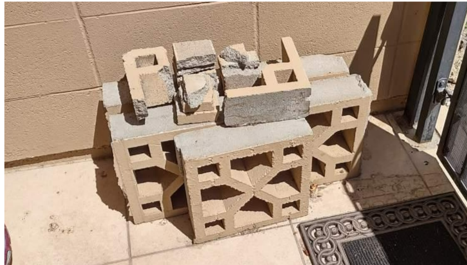
ORIGINAL DISPLACED AND DAMAGED BREEZE BLOCK TO BE REPAIRED & RE-INSTALLED IN-KIND