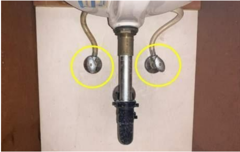
REPLACE ANGLE STOPS DUE TO AGE