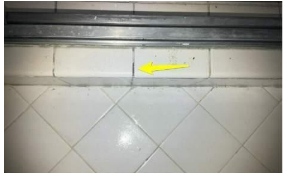
TILE & GROUT REPAIR