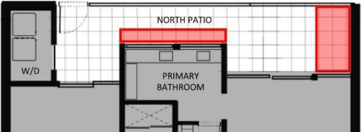
NORTH PATIO PLAN SHOWING LOCATION OF PLANTERS TO BE RESTORED