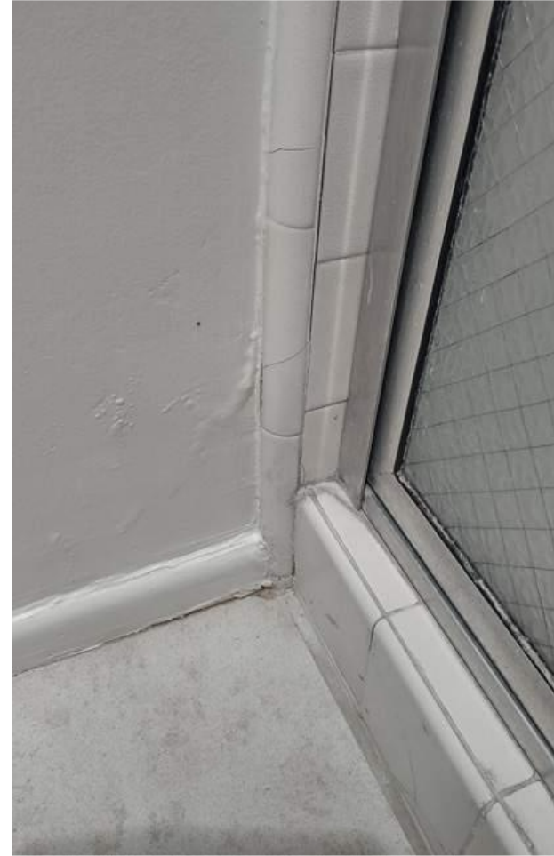
TILE & WALL REPAIR