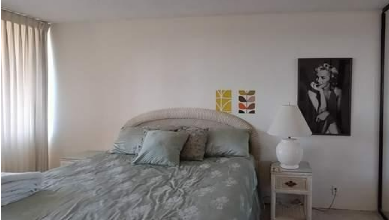
REMOVE WALL FRAMING & DRYWALL, RESTORE EXPOSED BLOCK WALL INTERIOR