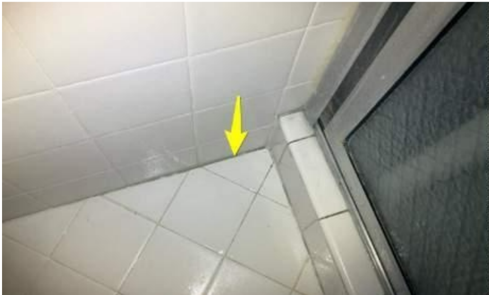
TILE & GROUT REPAIR