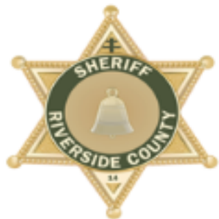
Average Response Times - Palm Desert