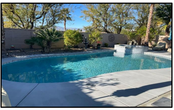
33' x 14' freeform pool & spa construction (Indio, CA)