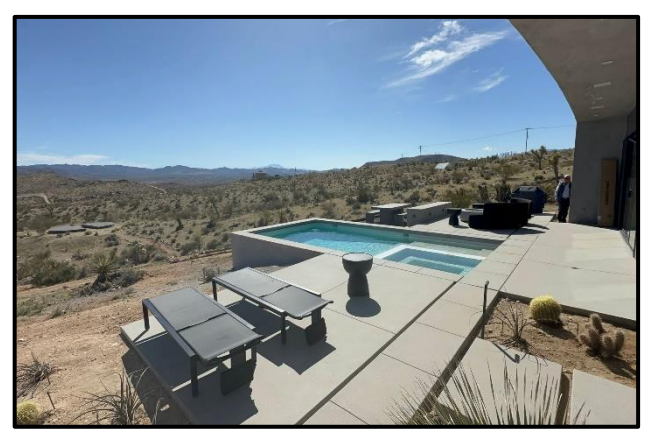
24' x 12' pool & spa construction (Yucca Valley, CA)