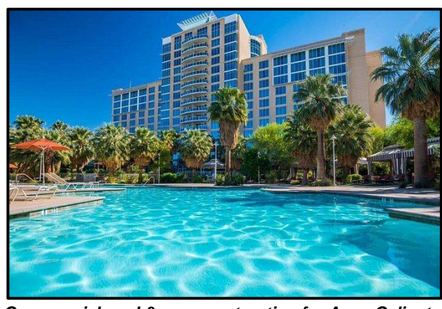
Commercial pool & spa construction for Agua Caliente Casino & Resort (Rancho Mirage, CA)