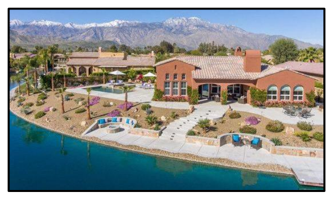
Pool & spa construction, new dock, deck, fire pit, and BBQ area (Rancho Mirage, CA)