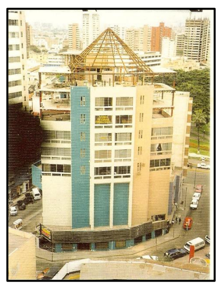
La Piramide Sky Room during construction (Lima, Peru)