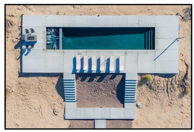
40' x 10' pool & spa construction (Twentynine Palms, CA)