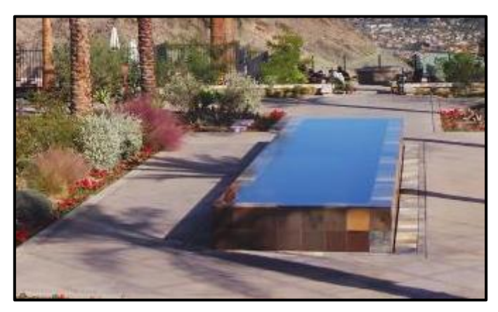
Water fountain construction for The Ritz-Carlton (Rancho Mirage, CA)