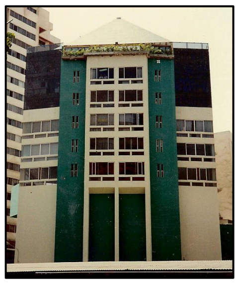
La Piramide Sky Room after construction (Lima, Peru)