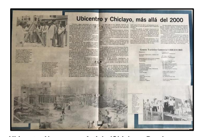
Ubicentro Newspaper Article (Chiclayo, Peru)