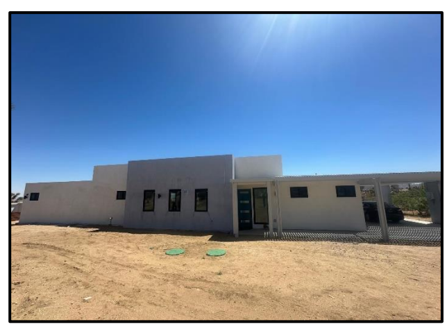
New single-family residence construction (Joshua Tree, CA)