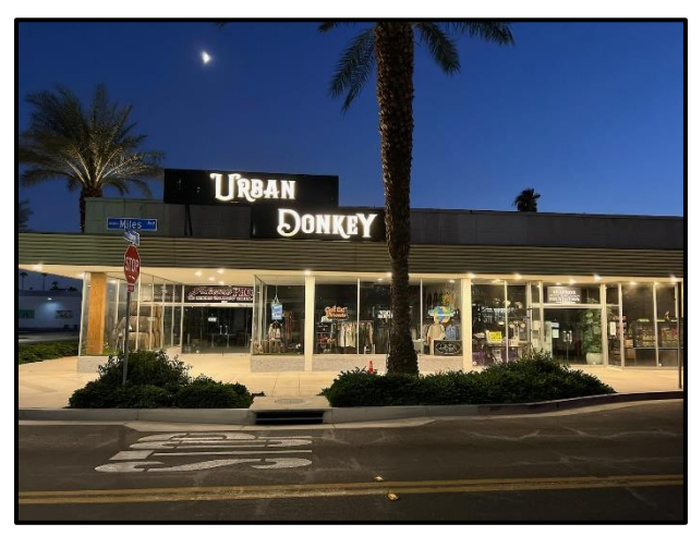
Urban Donkey after Remodeling (Indio, CA)