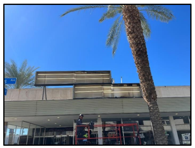
Urban Donkey before Remodeling (Indio, CA)