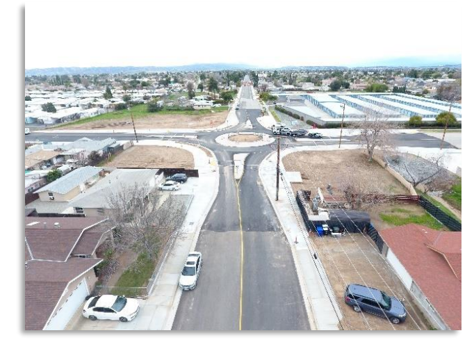
City of Calimesa | LLP County Line Road | Traffic Engineering