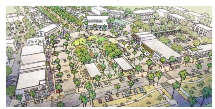
City of Palm Desert | General Plan

The TKE Team is eager and prepared for an opportunity to support the City of Palm Desert in accomplishing its goals developed for their CIP, New Strategic Plan and General Plan and to establish the framework for making informed decisions regarding the community's future success. Our team specializes in developing processes and procedures based on professional expertise and lessons learned, which we implement on all of our projects to ensure successful delivery on schedule and within budget.