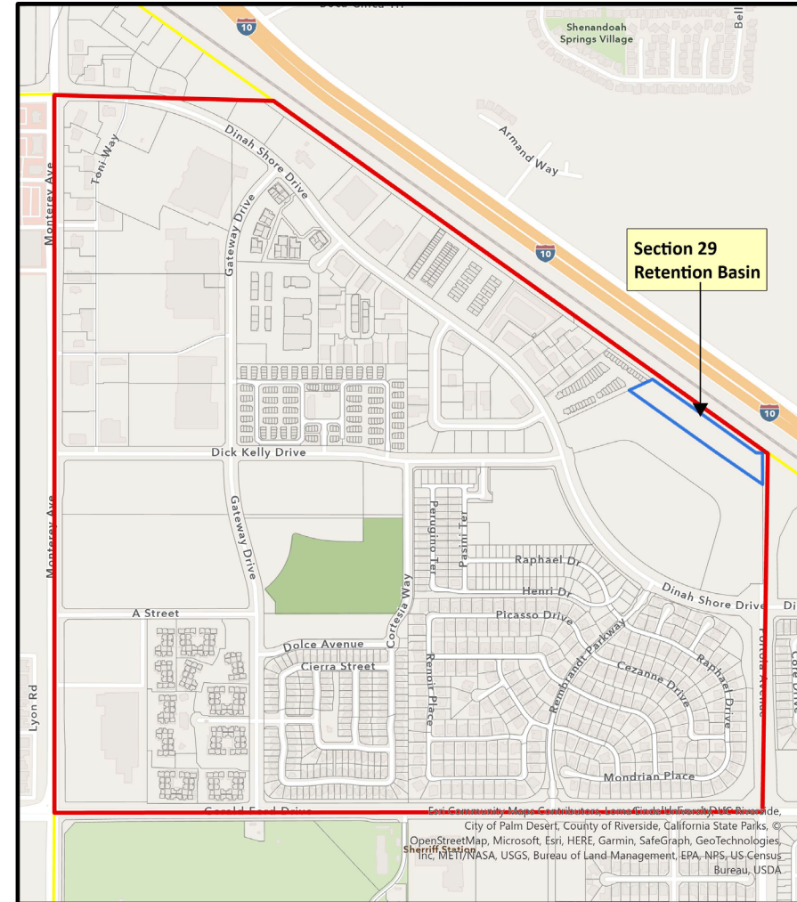
Section 29 Retention Basin